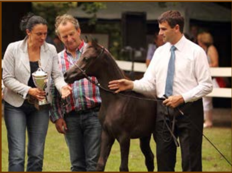
La Diva Nile-La (Ansata Nile-Echo x CD Anasta) as foal at the Egyptian Event Lanaken in 2012.