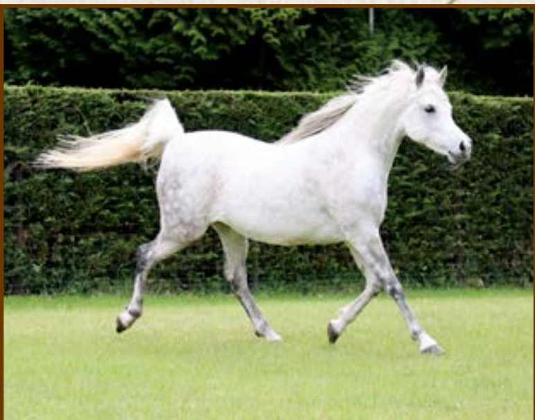
La Diva Nile-La (Ansata Nile-Echo x CD Anasta).