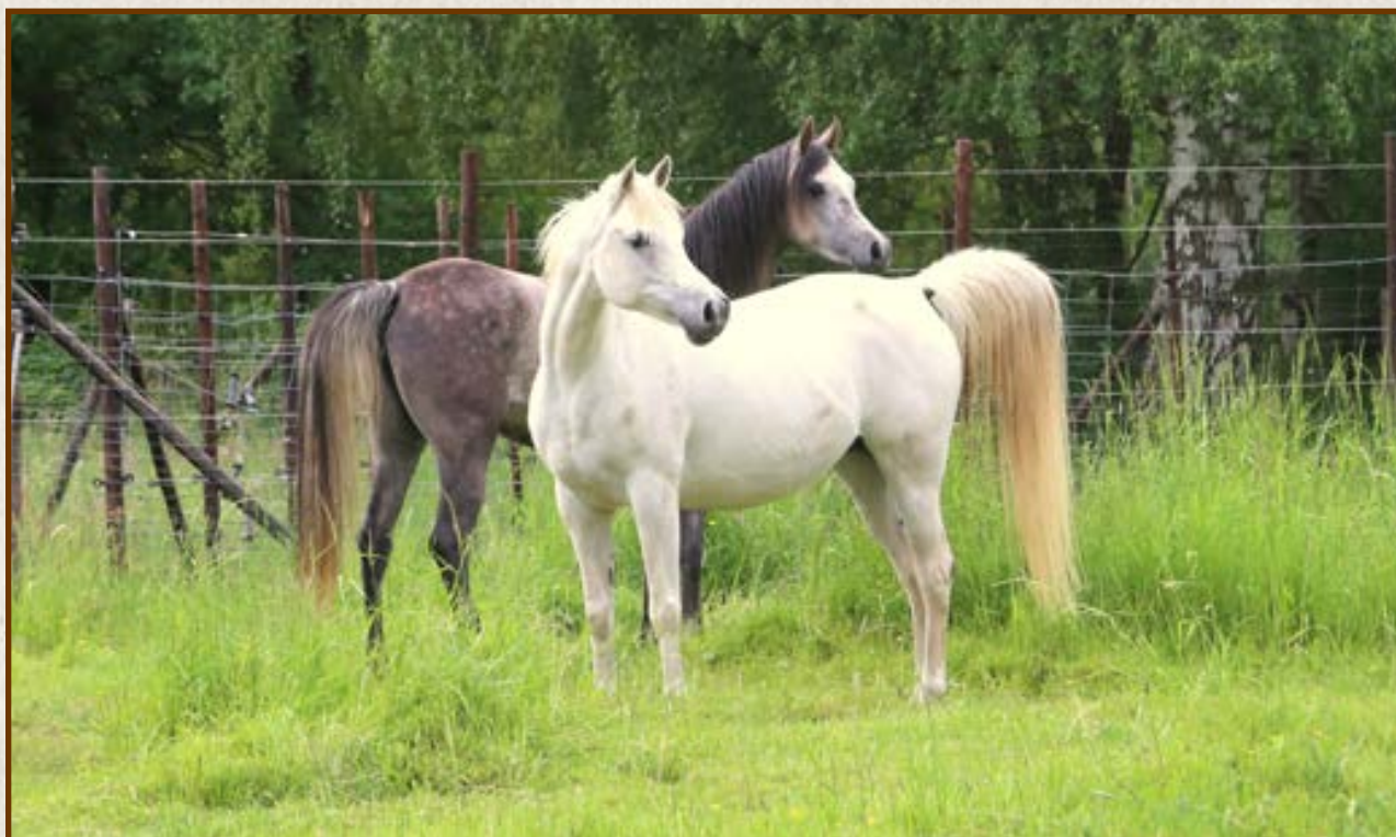
La Diva Noaa (Sahib x CD Anasta) and Ladiva Nile-La on the pasture at the farm.