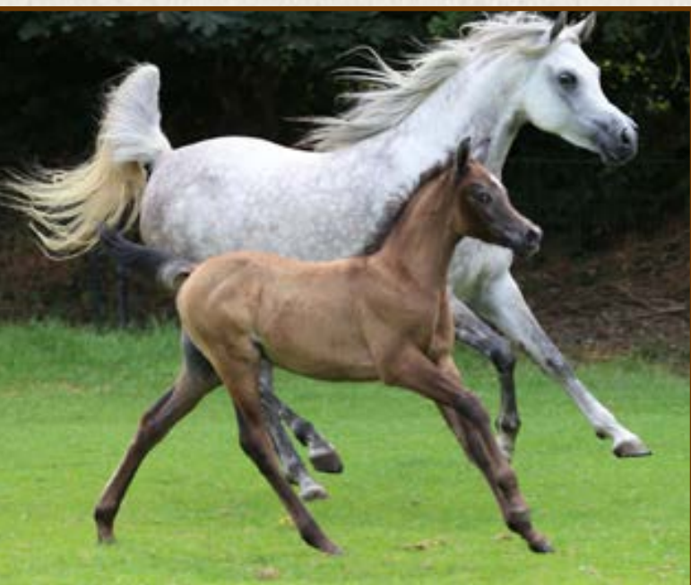
La Diva Noor with her daughter La Diva Sahida (Sahib x la Diva Noor).