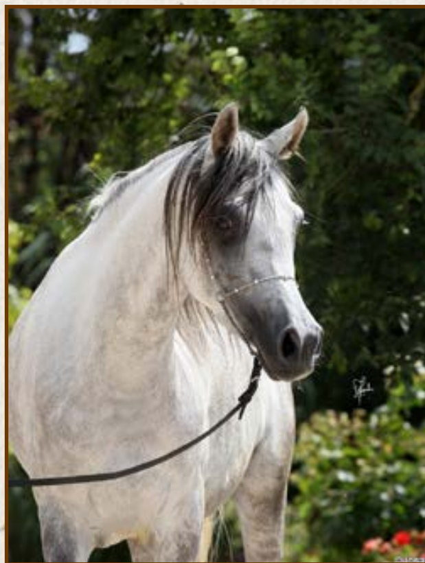
La Diva Nooa (Sahib x CD Anasta) went to DG Arabians Albania.