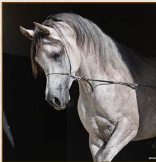
La Diva Nadeem (Ansata Nile-Echo x CD Anasta ) went to Pakistan.