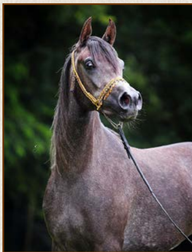
La Diva Safina (Ansata Nile-Echo x CD Anasta) went to Saudi Arabia.