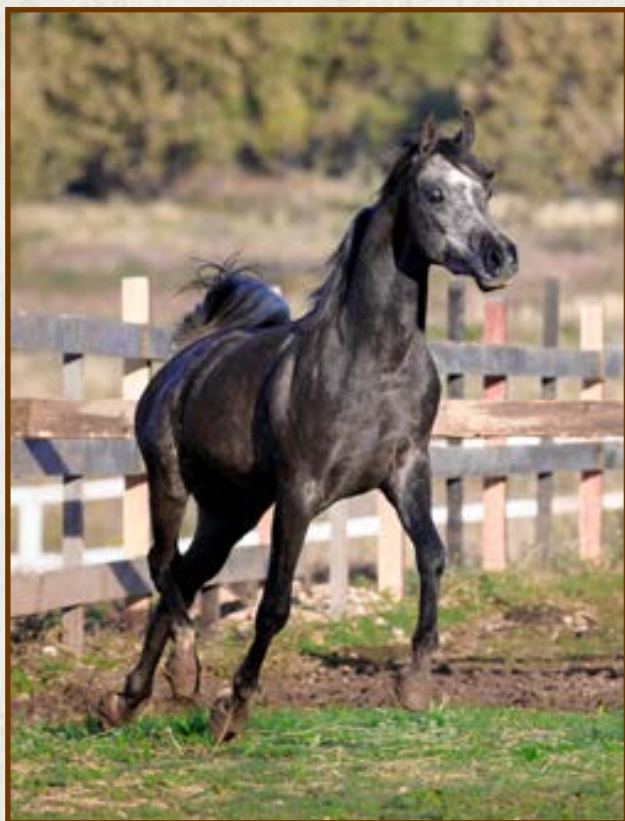
La Diva Omar (Ansata Nile-Echo x CD Anasta) went to DG Arabians Albania.