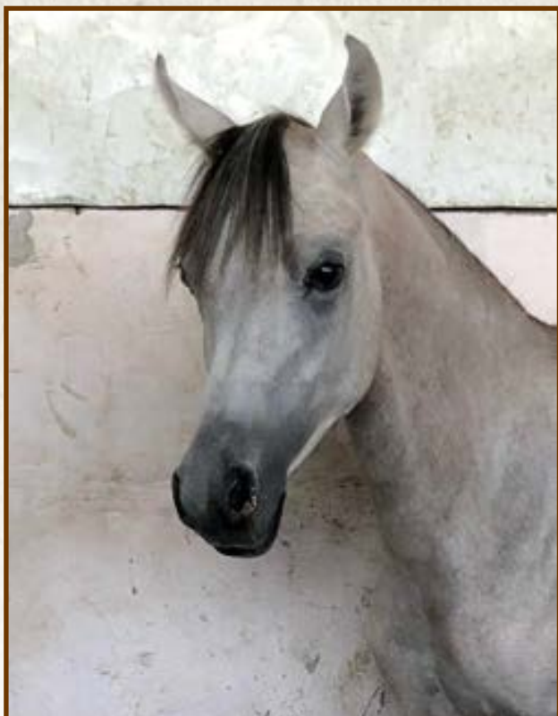
La Diva Naseema ( Naseem Al Rashediah x Pashmina) went to Israel.